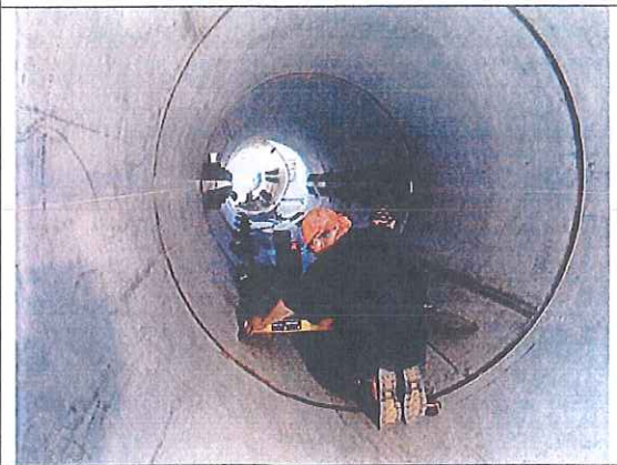
View of the fit up of internals in-process