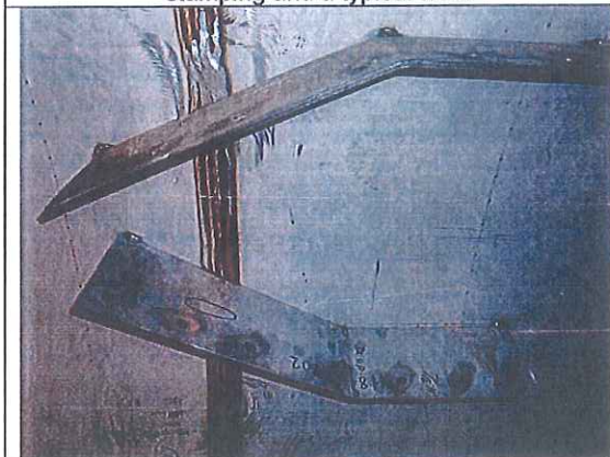
View of weld internals that were checked. The round seam these cross was not radiographed and although it was verified to be spot only if by repairs full RT was required this will be an issue.