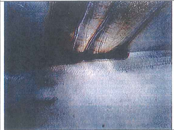
View of weld internals that were checked – close up of the issues mentioned left.