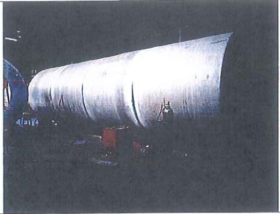
Overview of another section of the tower