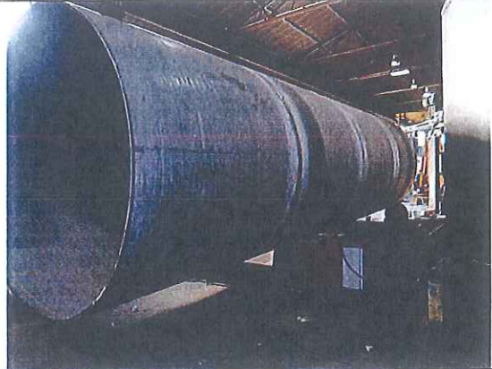
Overview of one section of the tower. Just on the edge of this picture was a carbon steel shell. This concern was discussed and they understood any contamination would need to be cleaned.