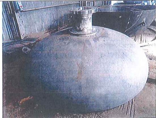
Overview of top head