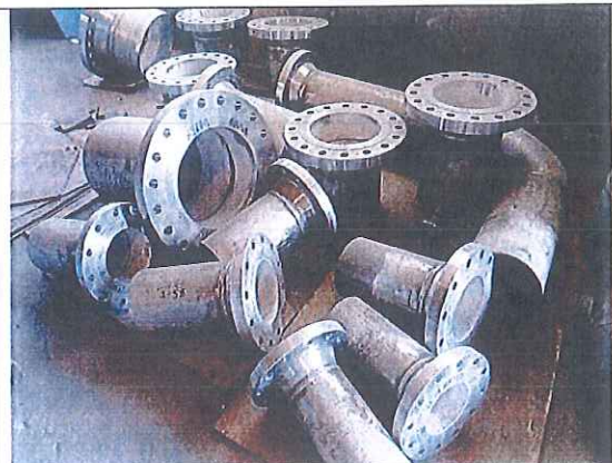
Nozzles during visual inspection